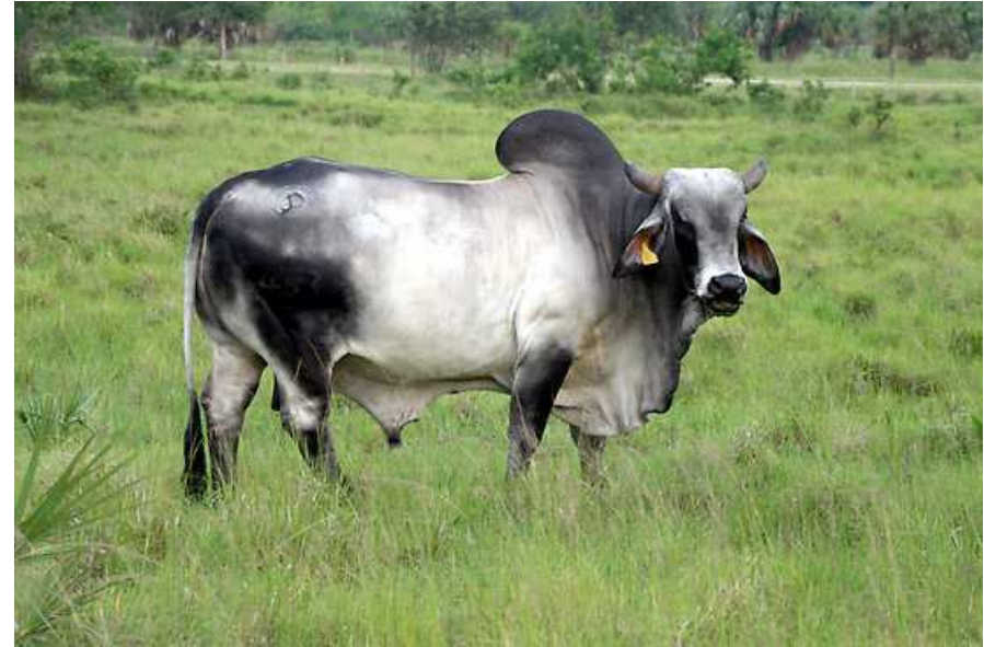
Zebu cattle ( Bos indicus )