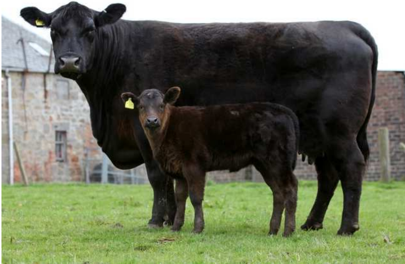
European cattle ( Bos taurus )