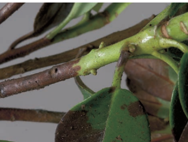
Foliar blight and dieback due to Phytophthora ramorum

Stem lesions: Some species may directly infect stems causing brown to black water soaked stem lesions. These may result in wilting and aerial dieback but no stem or root death.